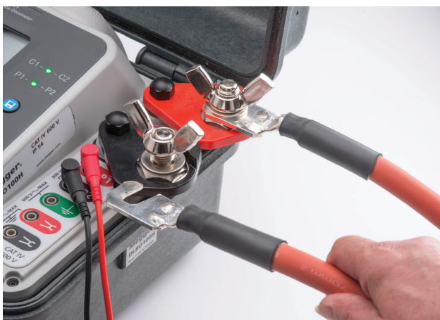
A new terminal adapter has been designed to enable the use of users own test leads.

DualGround™ capability with the DC clamp