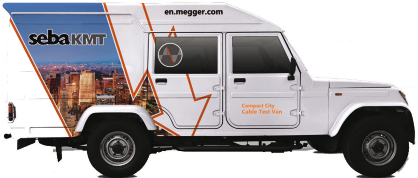
Customized Mahindra Bolero Camper