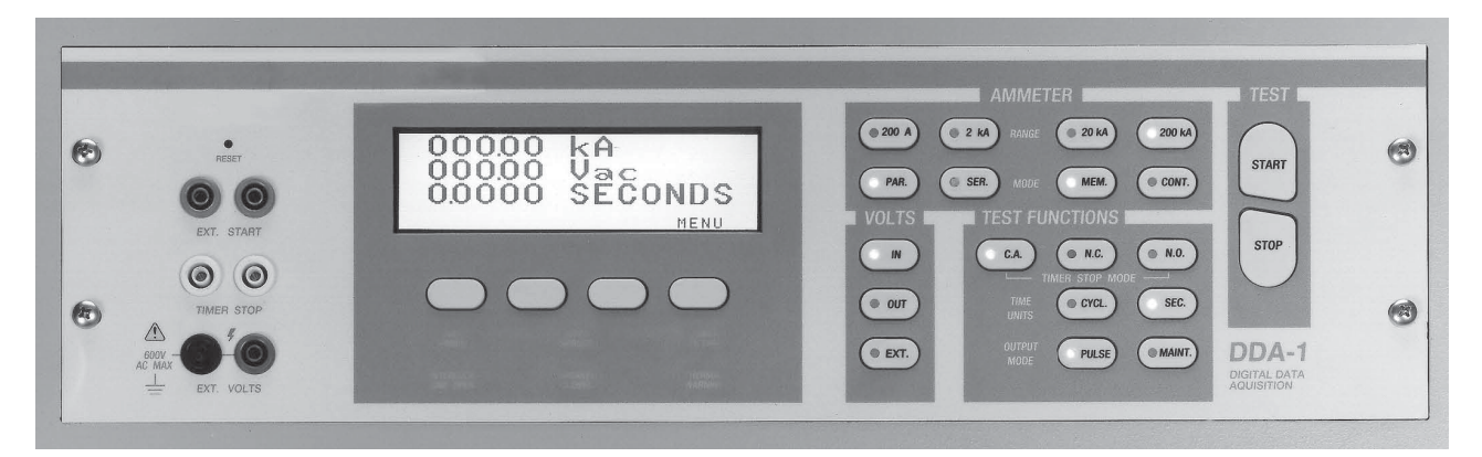
The Model DDA-1 control panel digitally samples the output current and mathematically calculates the current supplied to the breaker under test.

The digital control of the SCRs also allows the unit to initiate at any point within 90 degrees of the zero crossover point of the output-current waveform. This will allow the intentional insertion of a dc offset into the waveform for a complete investigation of a breaker's operation.