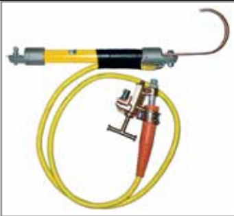
22629 STATIC DISCHARGE STICK W/ UNIVERSAL ATTACHMENT